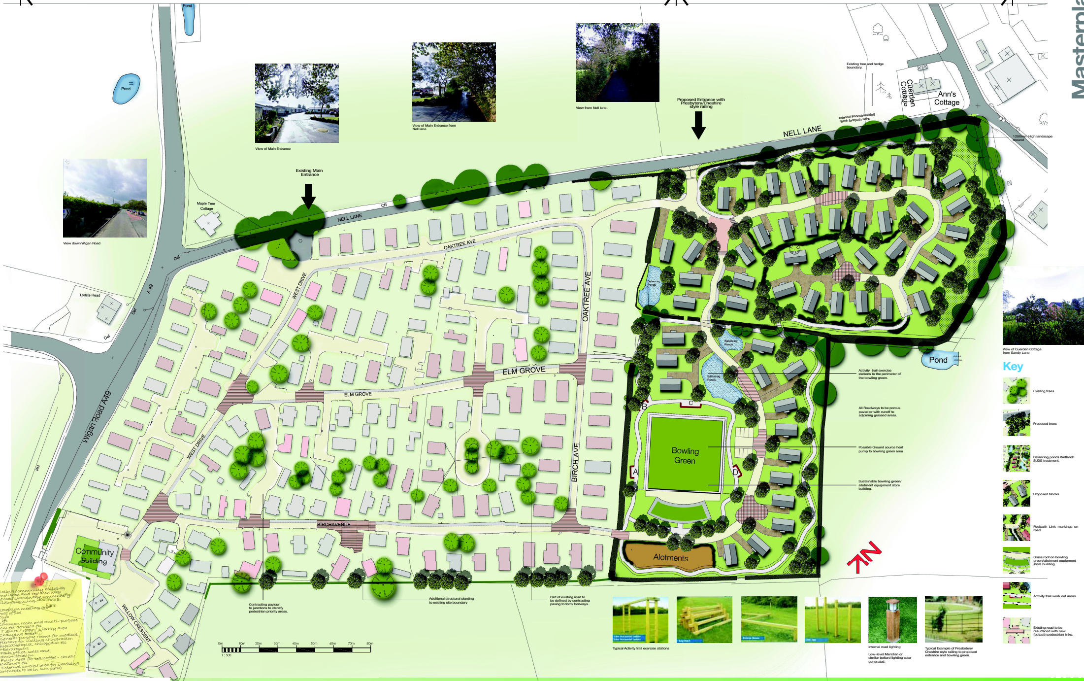
1200mm High landscape board