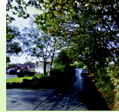
View of Main Entrance from Nell Lane