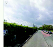
View down Wigan Road