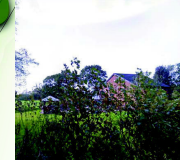
View of Cuerden Cottage from Sandy Lane