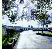
View of Main Entrance